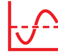
1. Average remuneration

The Workplace Gender Equality Agency (WGEA) quantifies Hacer's gender pay gap using two measures: